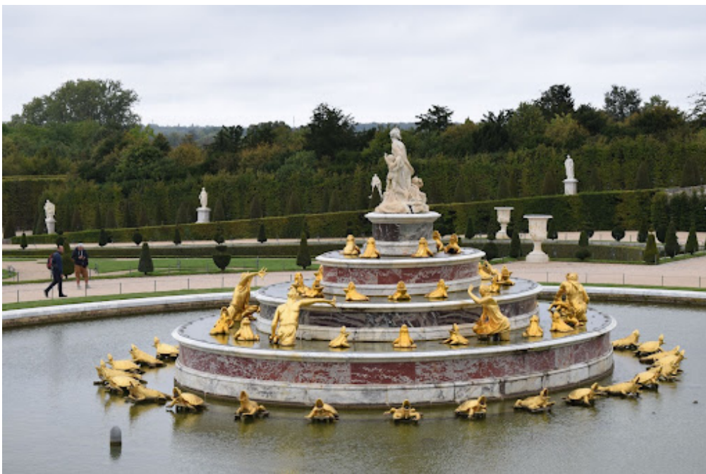
Garden of Versailles

Another must-see place in Paris is the opulent Versailles Palace and its stunning gardens located away from the city. A guided tour of the palace is recommended, as the entire building is replete with artworks and rooms symbolizing French history and the lavish lifestyle of its monarchs.