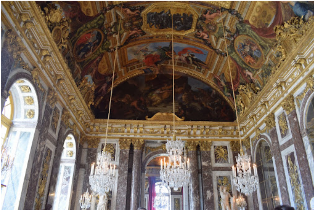
Interiors of the Paris of Versailles

Another must-see place in Paris is the opulent Versailles Palace and its stunning gardens located away from the city. A guided tour of the palace is recommended, as the entire building is replete with artworks and rooms symbolizing French history and the lavish lifestyle of its monarchs.